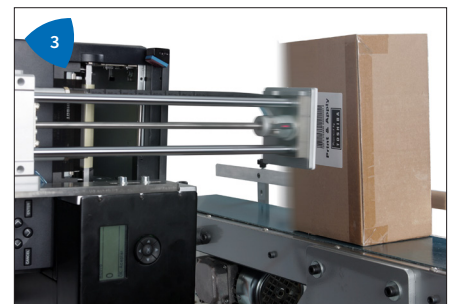
3 Versatile, applying labels from the top, bottom or sides in any rotation.